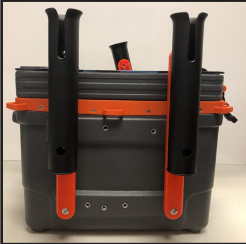
Configuration #1 ( Double-Verticle )