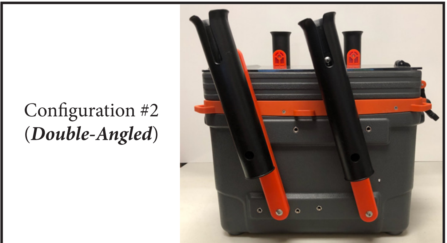
Configuration #2 ( Double-Angled )